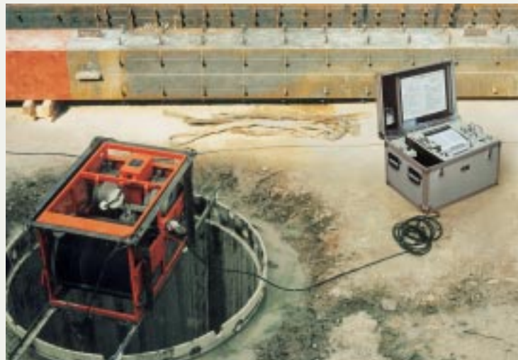
The winch unit and recorder unit on site