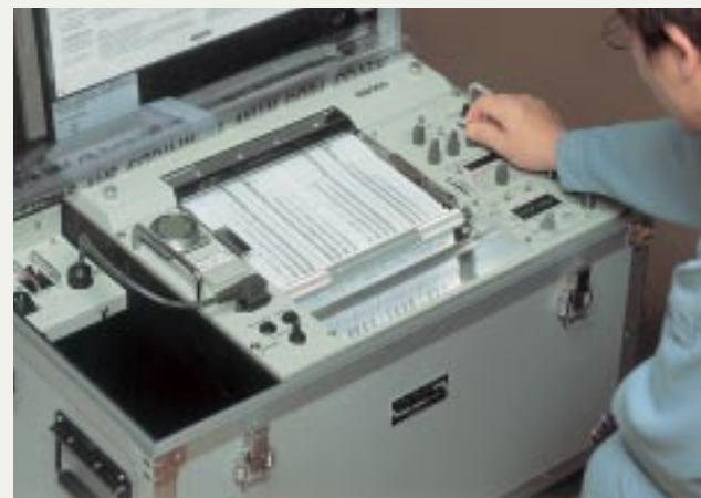
Recording the echo of a drilled hole